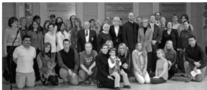
Attendees at the February 25, 2008 concert.

The concert was also sponsored by the Northeastern Illinois University and the Council of Educators in Polonia.