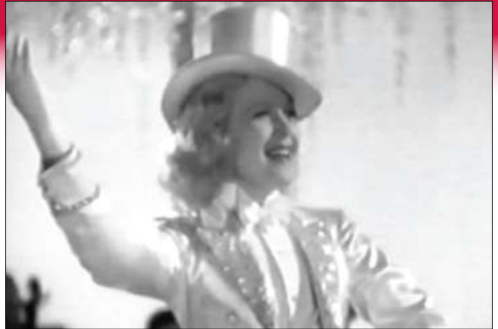
Mme Marta Eggerth in the 1930s

It was on the set of the 1934 film Mein Herz ruft nach dir (My Heart is Calling You) that she met and fell in love with the dashing young Polish tenor, Jan Kiepura. They were married in 1936 and together became known as Europe's Liebespaar (Love Pair)