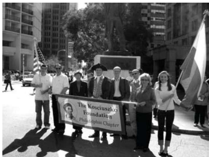
PHILADELPHIA PULASKI DAY PARADE: The Kosciuszko Foundation's Philadelphia Chapter marched in Philadelphia's Pulaski Day Parade with pride back in October.