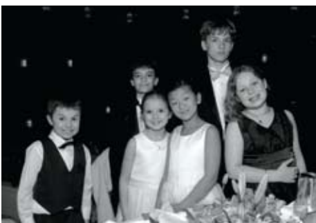
Just a few of the many children at this year's ball strike a pose for the camera.